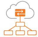
SmartZone Data Plane