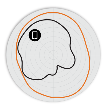
Figure 2. H550 2.4GHz Azimuth Antenna Patterns