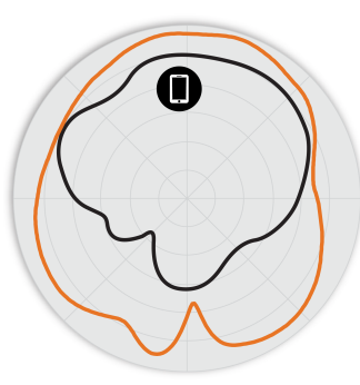
Figure 3. H550 5GHz Azimuth Antenna Patterns