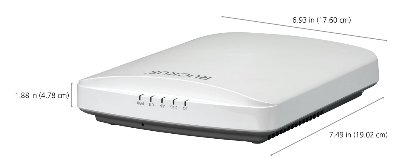
Weight: 1.24 lbs (0.562 kg)