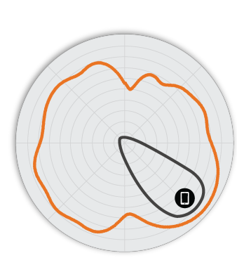
Figure 4. R550 2.4GHz